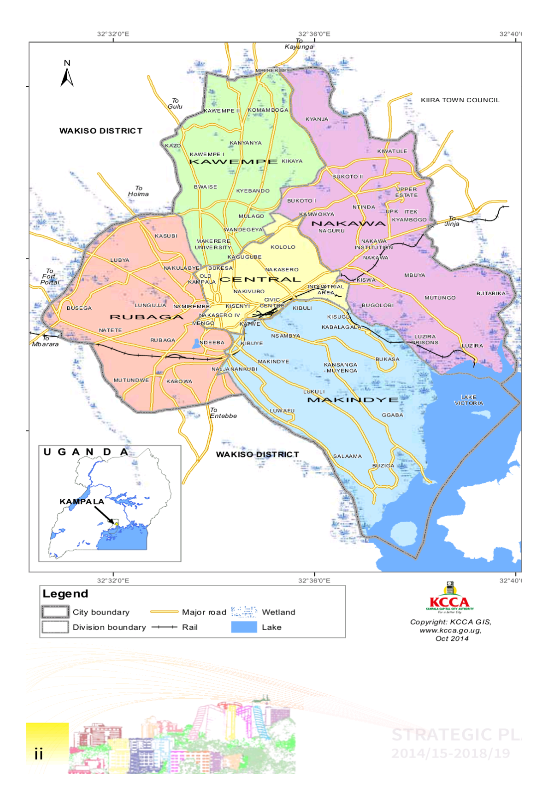
APPENDIX 6: Map 1: Location of Makindye Division in KCCA