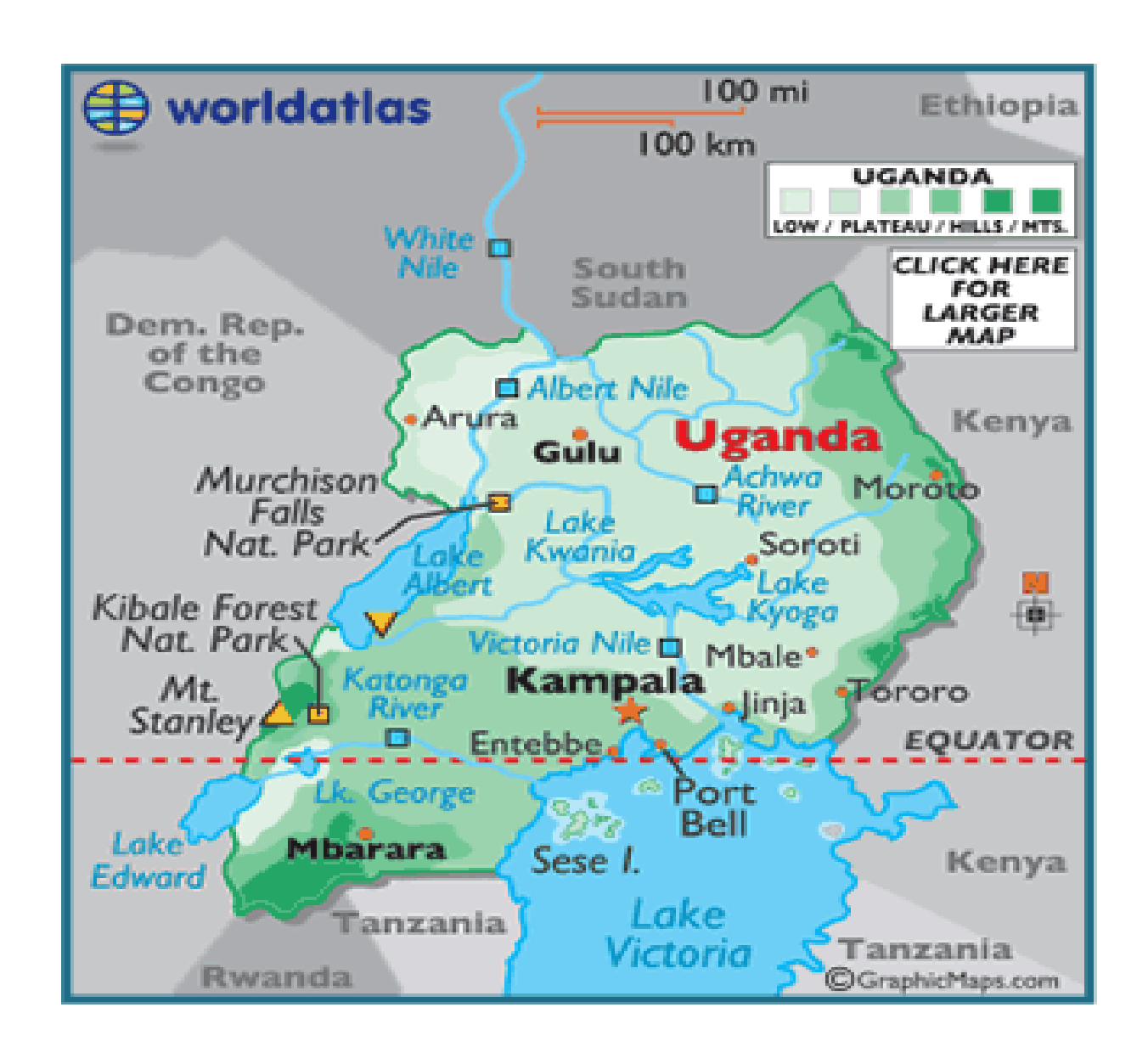
APPENDIX 5: Map 1: Location of Kampala in Uganda