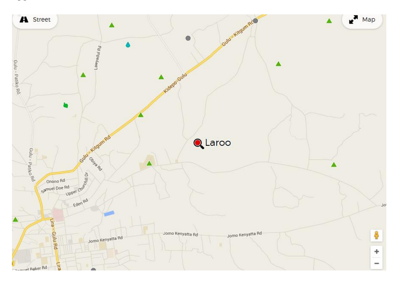
Appendix v: MAP OF LAROO